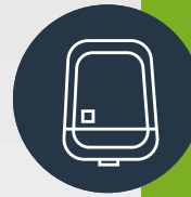
ABB Inverters - Repair and service for a wide range of products

ABB (Asea Brown Boveri) Ltd. is a Swiss group of companies with extensive experience in the field of solar technology and over 140,000 employees. The high-performance Power-One inverters were integrated into the product range following the takeover of the American manufacturer by ABB and are still available to you under the new name.