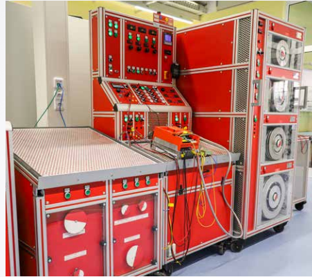
Universal test stand for frequency converters

Our services from one source help you to bundle time and resources and eliminate the need for expensive migration to successor products. Certifications for your machinery and systems will be preserved. In doing so, we don't just optimise your maintenance costs, we also ensure that your machinery and systems get “the right power” on a long-term basis.