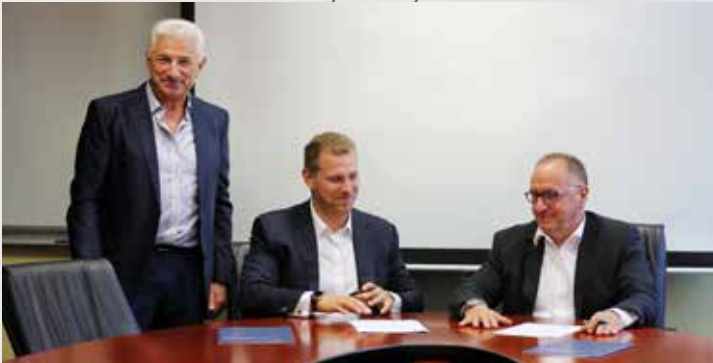
The signing of the new co-operation agreement took place at the premises of BVS Electronics.

Since 2015 we have been the only company worldwide in the controller and drive industry to become an official „ Bosch Rexroth Service Point “. This marked the first time ever that a company from the industrial electronics servicing industry was awarded this status.